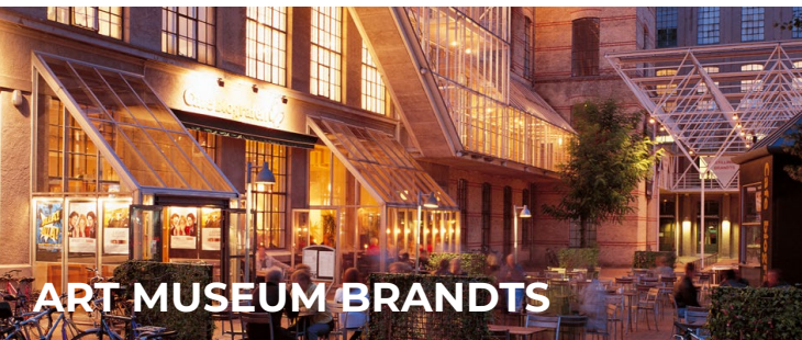
ART MUSEUM BRANDTS