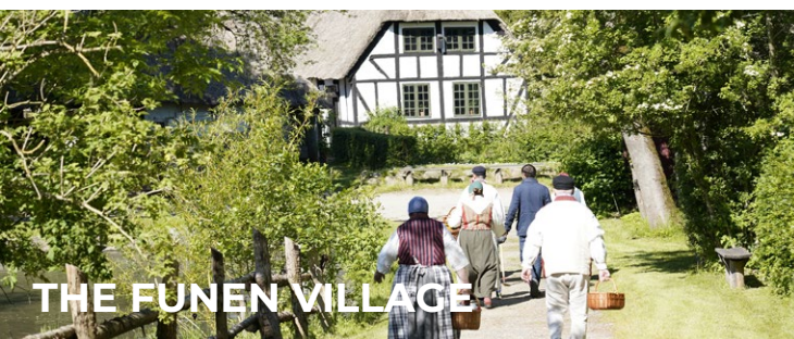
THE FUNEN VILLAGE