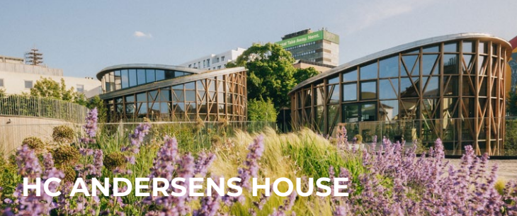
HC ANDERSENS HOUSE