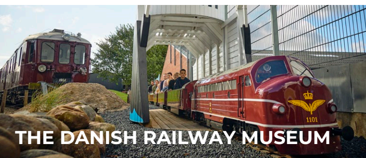
THE DANISH RAILWAY MUSEUM